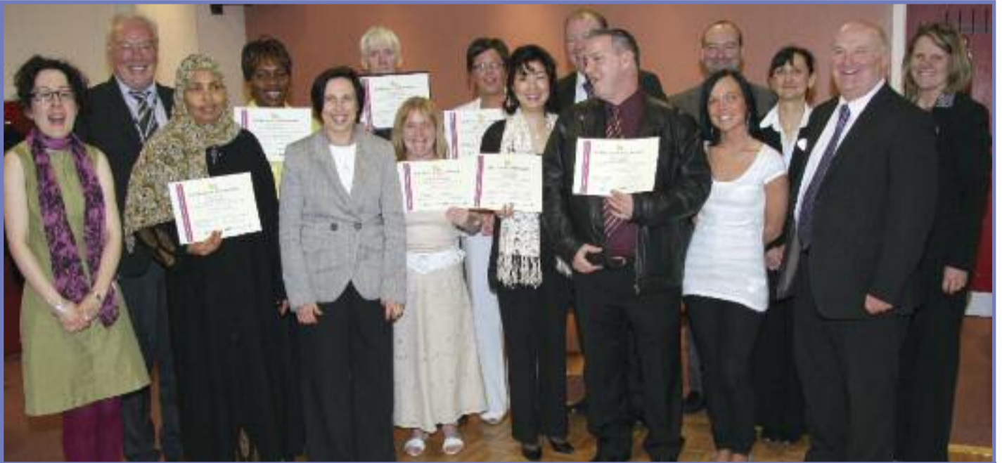
KEYS TO LEARN... graduates with representatives from the four partner organisations

CELEBRATION events have been held to mark the achievements of participants in two important training initiatives.