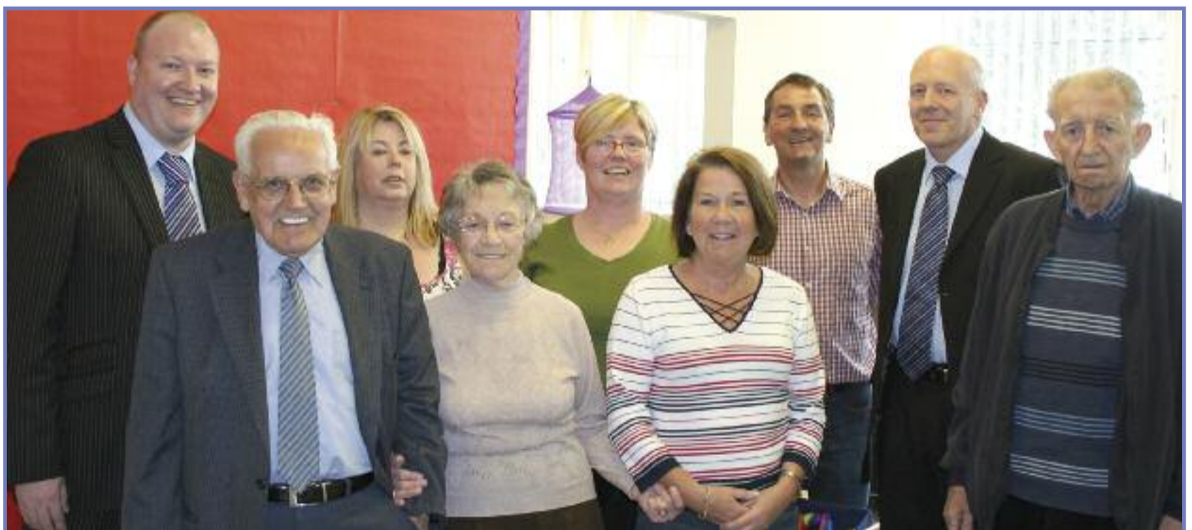
Red Road Family Centre staff meet with their new neighbours from the Alive and Kicking Project

For more information on Red Rd Family Centre contact 0141 557 5571 .