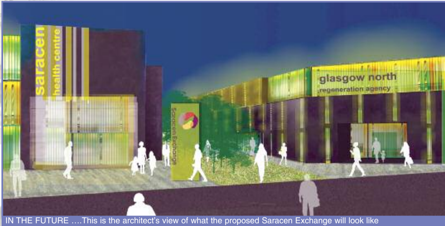
IN THE FUTURE ....This is the architect's view of what the proposed Saracen Exchange will look like

POSSILPARK is set to benefit from a £15million investment that will transform a derelict site on Saracen Street into a state of the art community facility for local people.