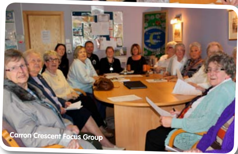
Carron Crescent Focus Group

F ocus groups have been running for a while now in a number of communities across North Glasgow.